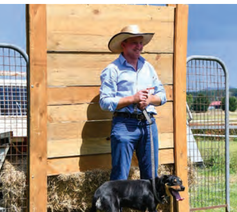
dog high jump