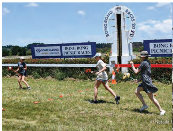
hobby horse race

Hobby Horse Race Sunday – 1pm Icelandic Horse display (Sat & Sun)